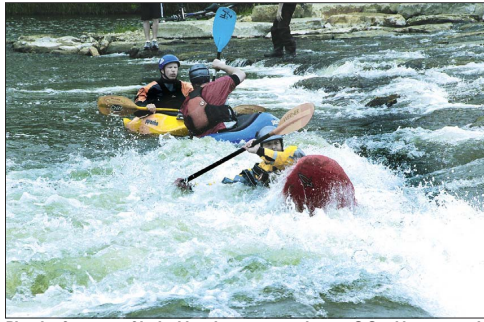
Play day for group of invited kayak veterans on the new C.C. whitewater park