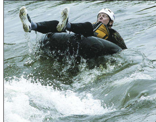
Spectators Sunday saw a variety of kayak wave riding, twists and flips, as well as innertube and even inflatable raft riding on the new Charles City whitewater park during a demonstration day.